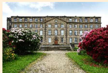
The Main House designed by James Taylor of Islington. Construction started in 1804 -and opened in 1808. The top floor - know as "Tip Top" was added in 1906.