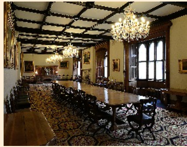
The Parlour designed by Edward Pugin, this was the formal dining room for the professors separate from the students.