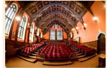
The Exhibition Hall, originally the location of the first college Chapel and subsequently became a theatre for all manner of performances.