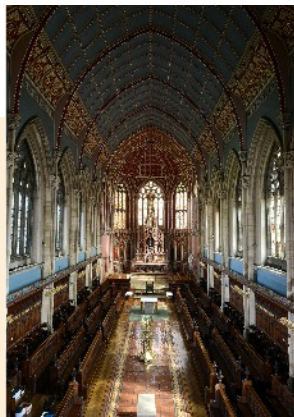
St Cuthbert's Chapel, originally designed by Augustus Pugin in 1847 and then redesigned and rebuilt Dunn and Hansom in 1882.