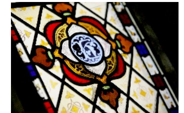
Ushaw College Library is home to the internationally significant archive and early printed book collections of the former Catholic seminary