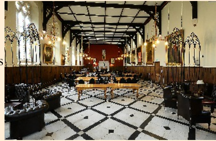
The Refectory, designed by Augustus Pugin - this was the dining hall for students where dinners were eaten in silence.